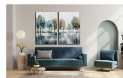
Misty Grove II